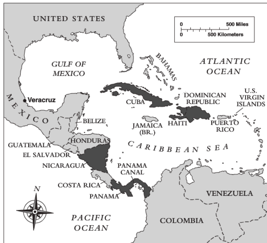
U.S. INTERVENTION IN THE CARIBBEAN, 1898 TO 1917

Conciliation Treaties Wilson's commitment to the ideals of democracy and peace was fully shared by his famous secretary of state, William Jennings Bryan. Bryan's pet project was to negotiate treaties in which nations pledged to (1) submit disputes to international commissions and (2) observe a one-year cooling-off period before taking military action. Bryan arranged, with Wilson's approval, 30 such conciliation treaties.